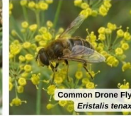
Common Drone Fly Eristalis tenax