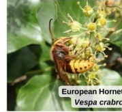
European Hornet Vespa crabro