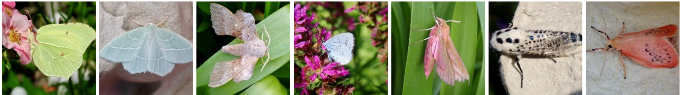
Clouded Yellow, Small Emerald, Poplar Hawk Moth, Holly Blue, Elephant Hawk Moth, Leopard moth and Rosey Footman

Larvae have different feeding preferences. Leaves, stems and branches of trees and shrubs and even the lichen that grows on them can feed larvae. Crevices in bark provide pupation and over-wintering sites. Clematis, buckthorn, poplar, holly, ivy, fuchsia, fruit trees, willows, hops, honeysuckle, and lichen are some of the foods for larvae of these butterflies and moths.