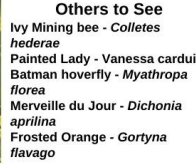
Others to See Ivy Mining bee - Colletes hederae Painted Lady - Vanessa cardui Batman hoverfly - Myathropa florea Merveille du Jour - Dichonia aprilina Frosted Orange - Gortyna flavago

Spotted any of these? Why not share them on our Facebook page @KentsPlanBee