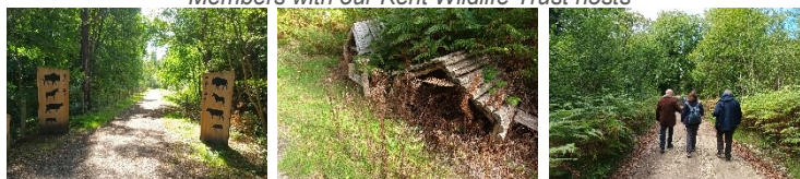
Sites from the walk, including the art trail and a bug hotel