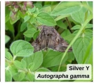
Silver Y Autographa gamma