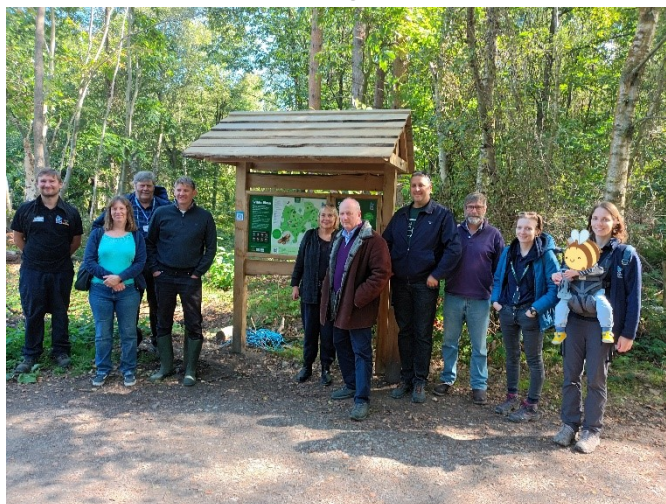
Members with our Kent Wildlife Trust hosts

For more information on the Wilder Blean project, go to the Kent Wildlife Trust website or follow their Facebook page for regular updates.