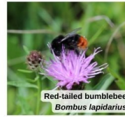
Red-tailed bumblebee Bombus lapidarius