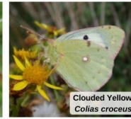
Clouded Yellow Colias croceus